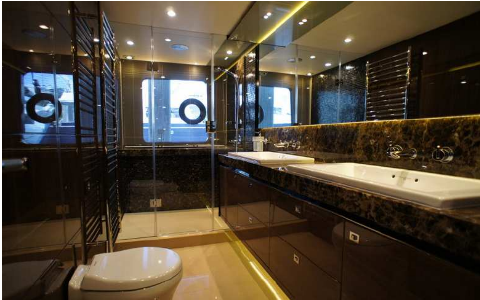
Princess 82' – Owner's Bath