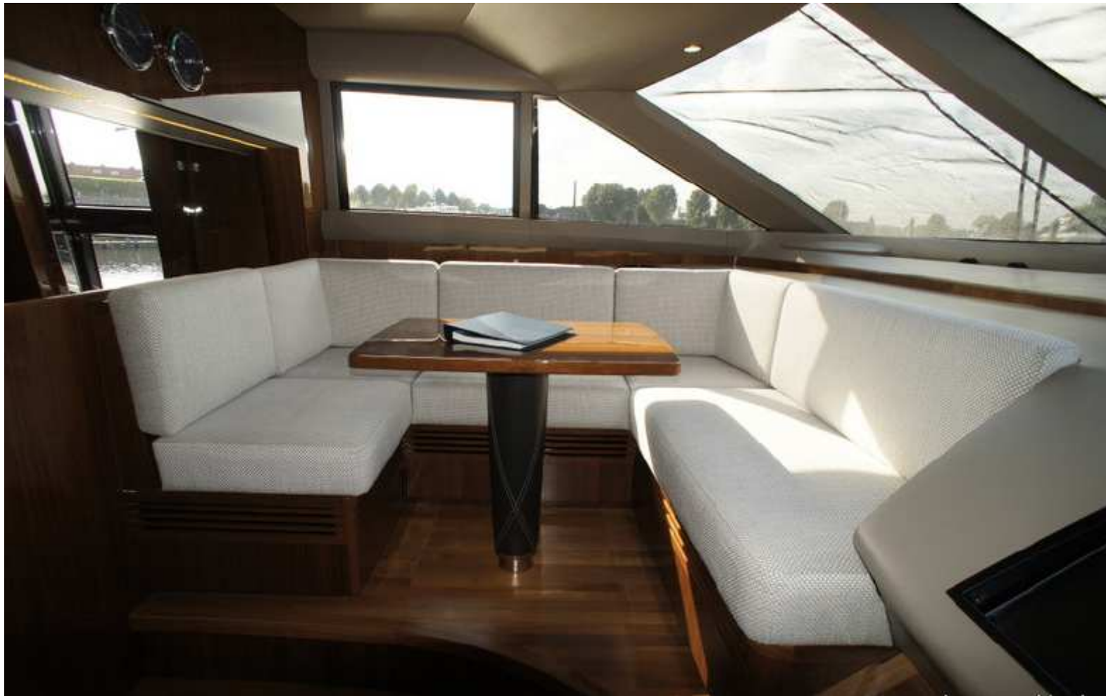
Princess 82' – Wheelhouse