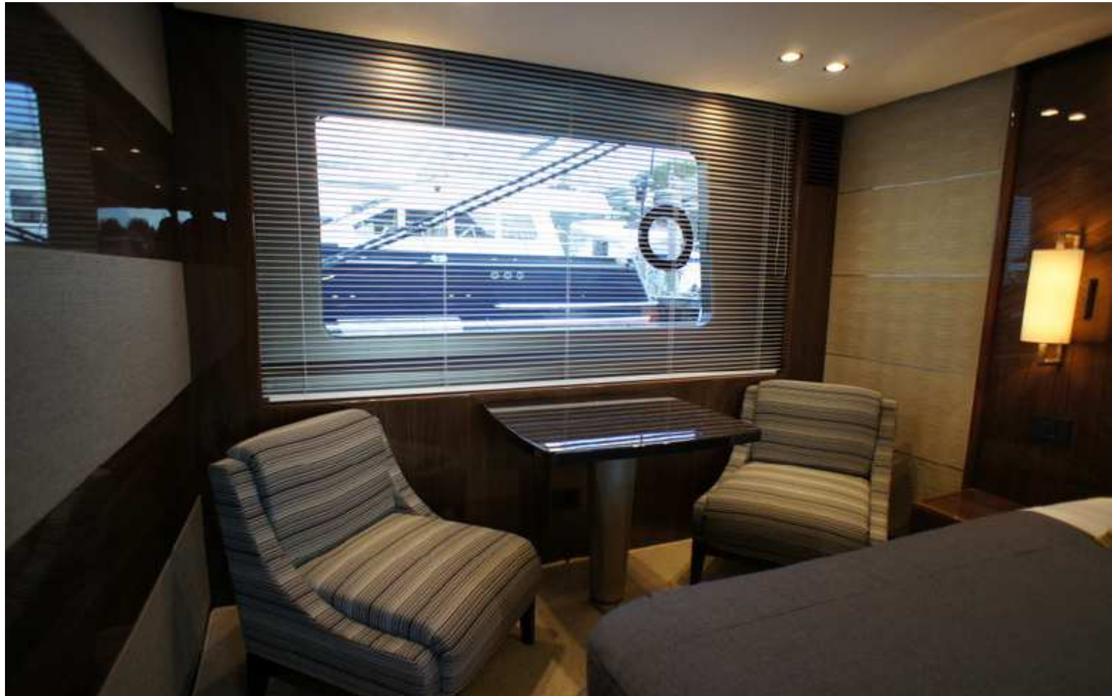
Princess 82' – Owner's Cabin