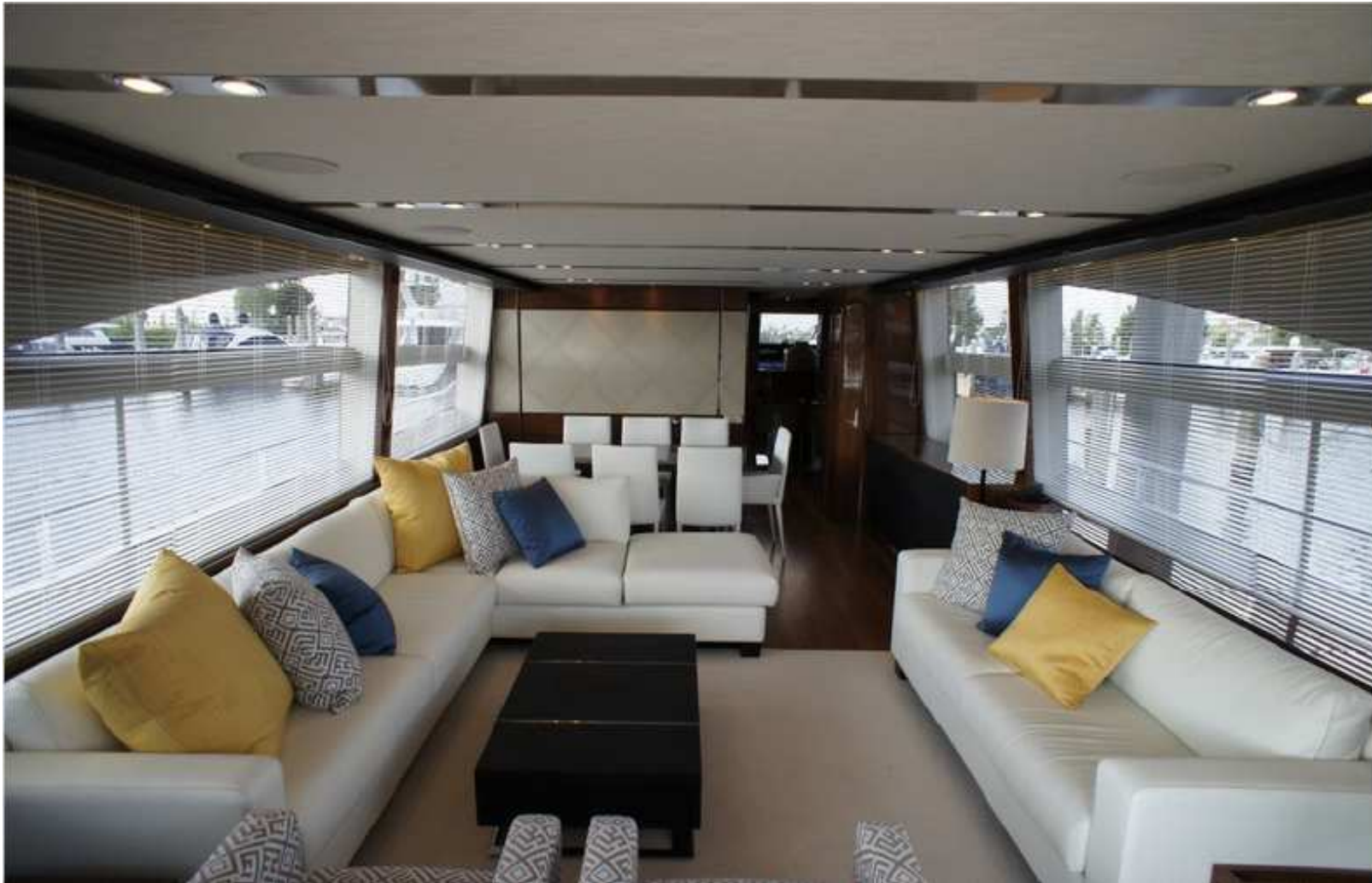
Princess 82' – Main Saloon