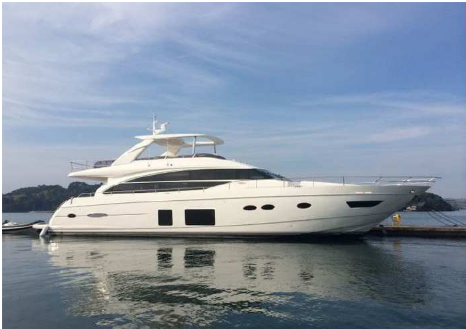
Princess 82' – External