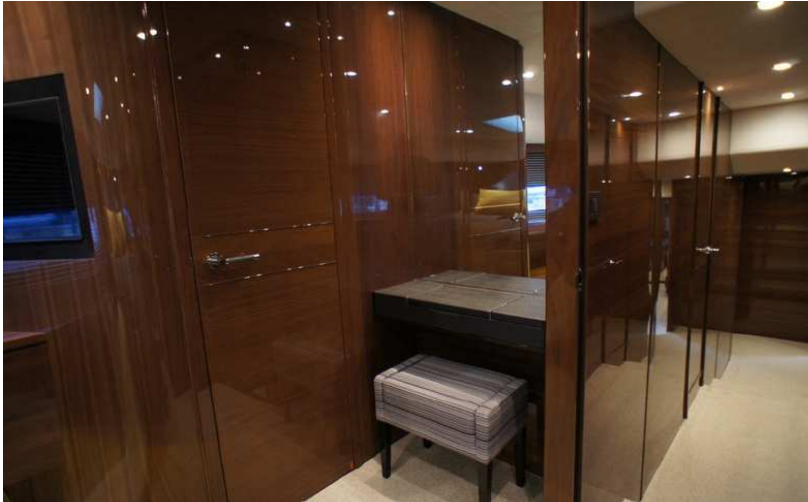
Princess 82' – Vip Cabin