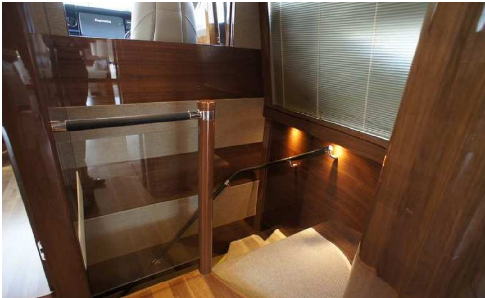
Princess 82' – Stairs