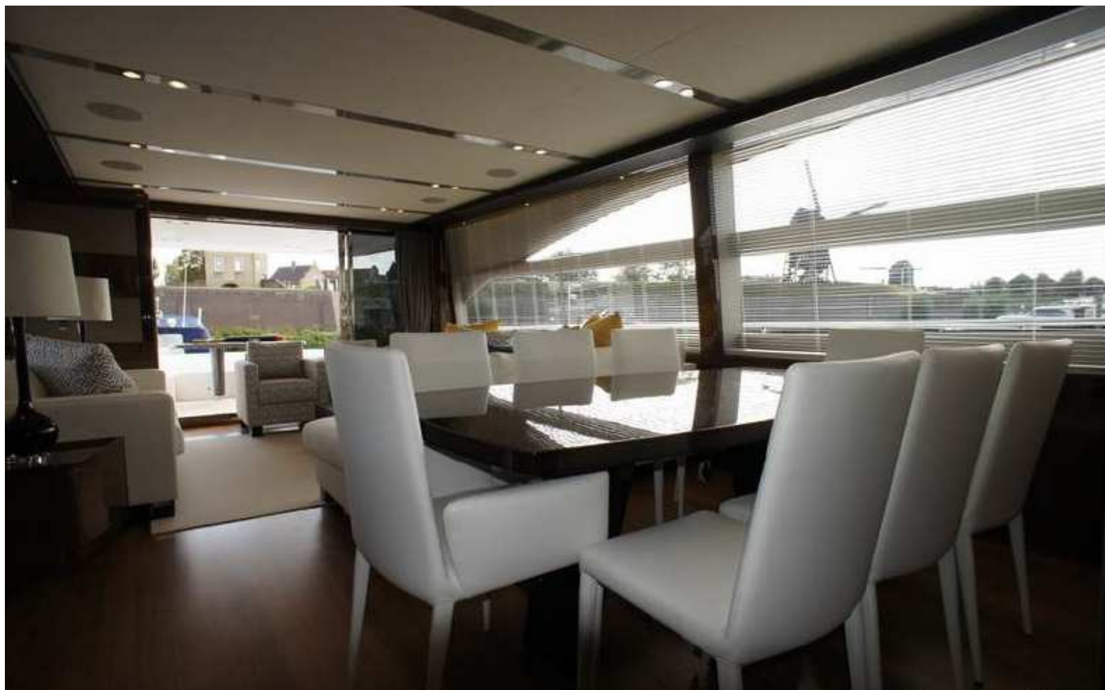
Princess 82' – Main Saloon Dining area