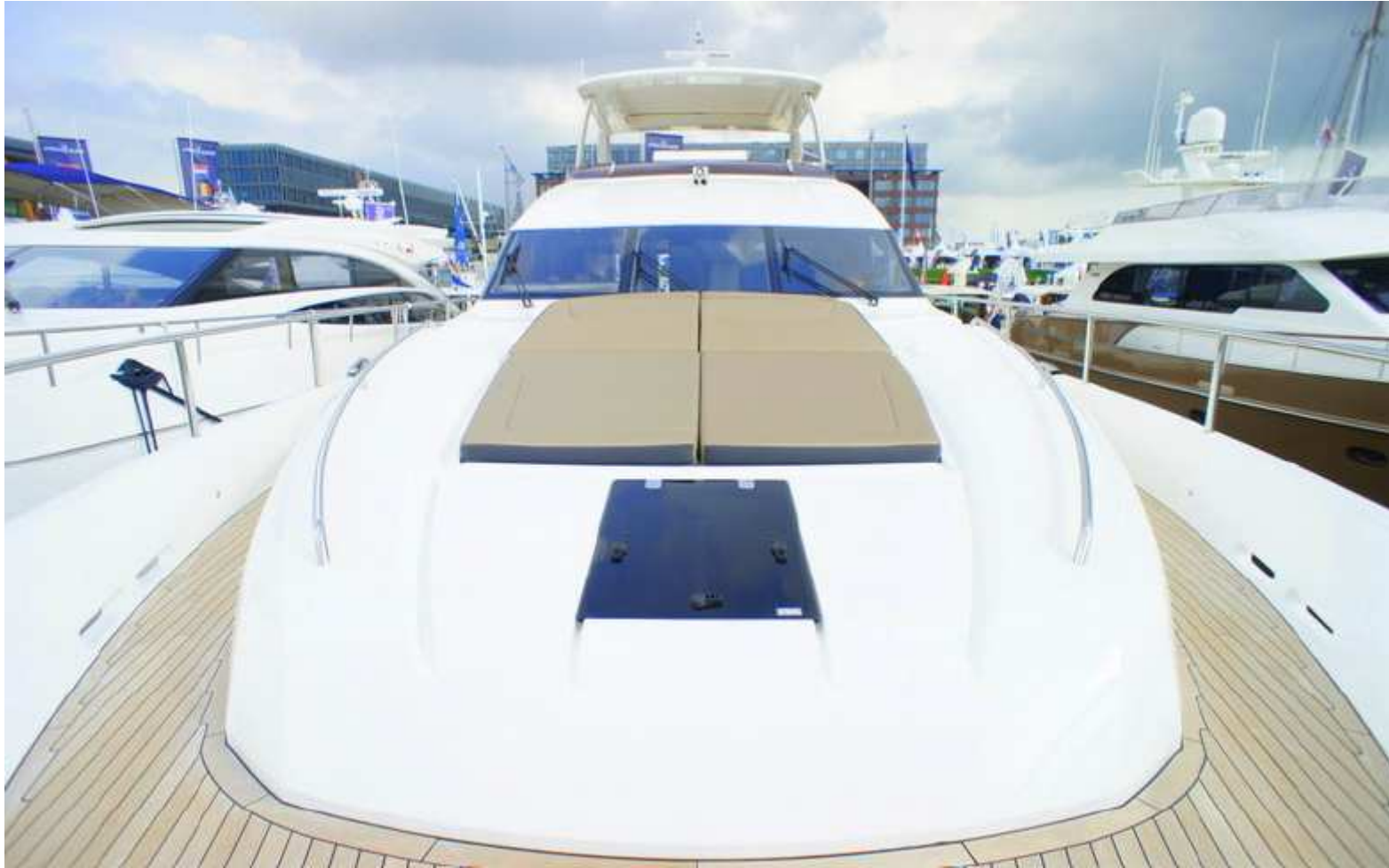
Princess 82' – Sun Deck