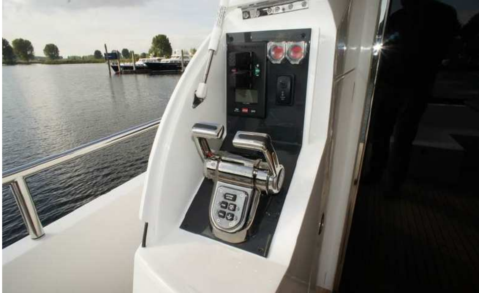
Princess 82' – Aft Control System