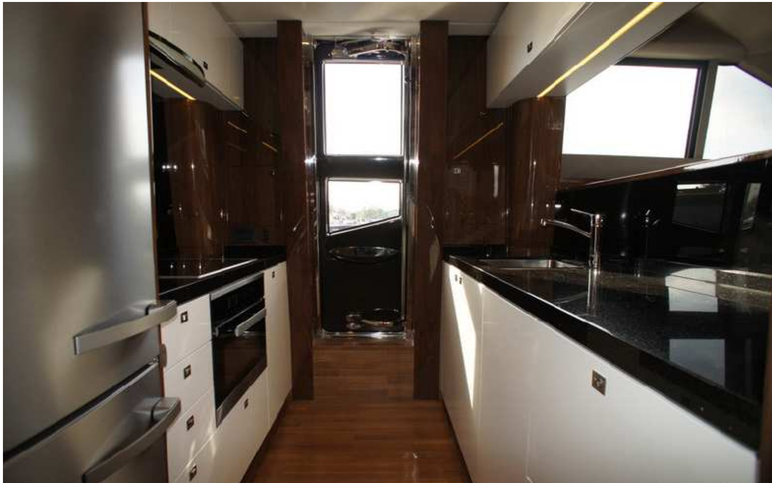
Princess 82' – Galley