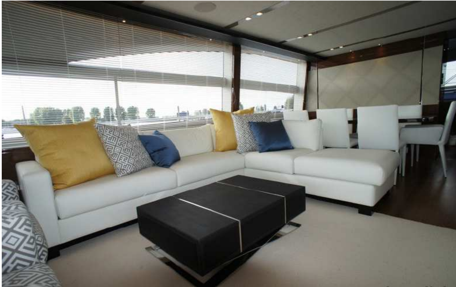
Princess 82' – Main Saloon