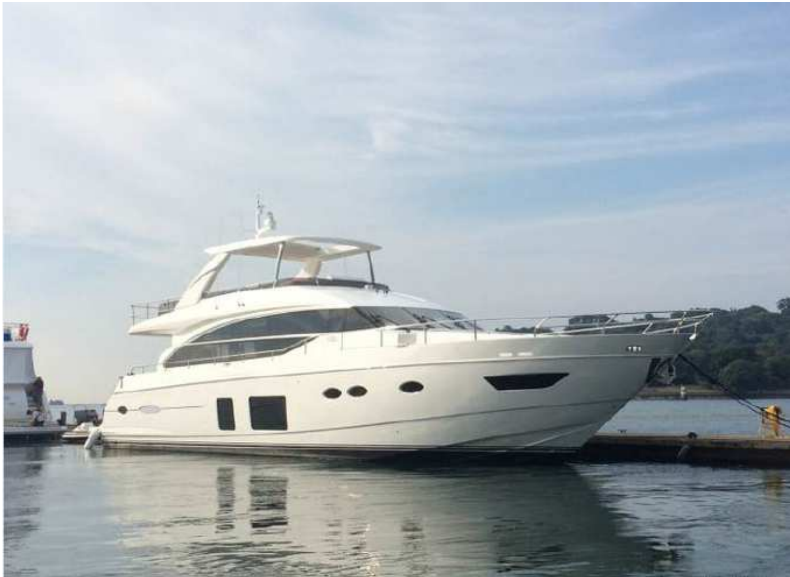
Princess 82' – External