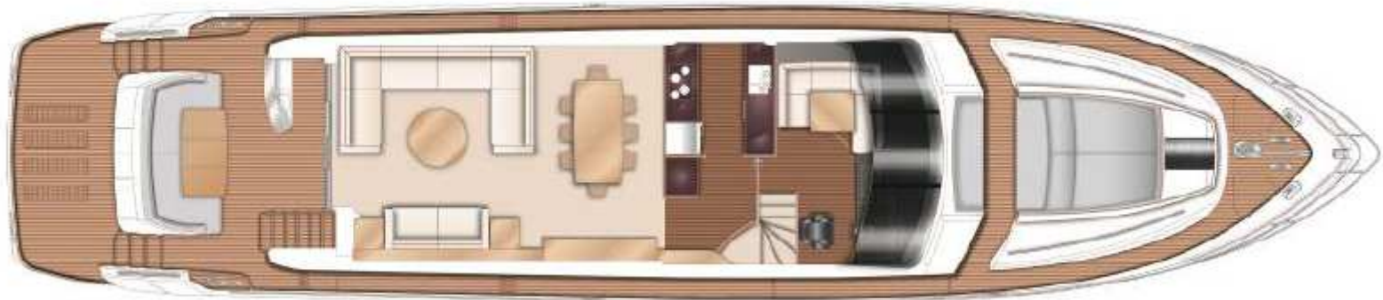
Princess 82' – Main Deck