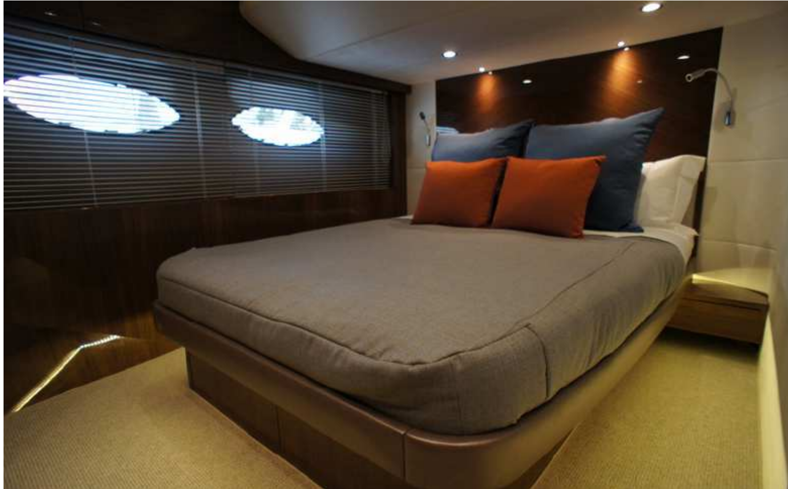
Princess 82' – Guests Cabin