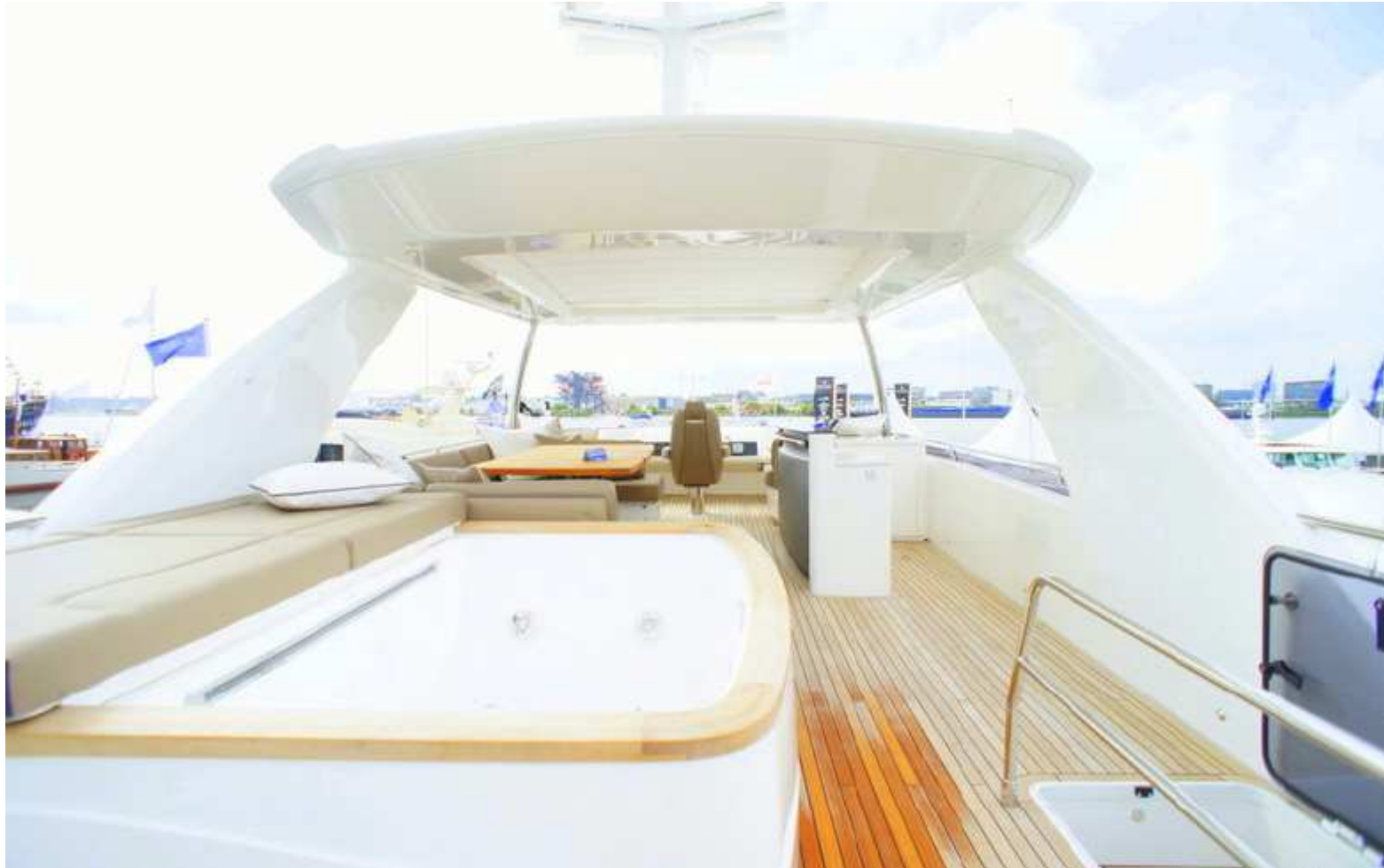
Princess 82' – Sun Deck