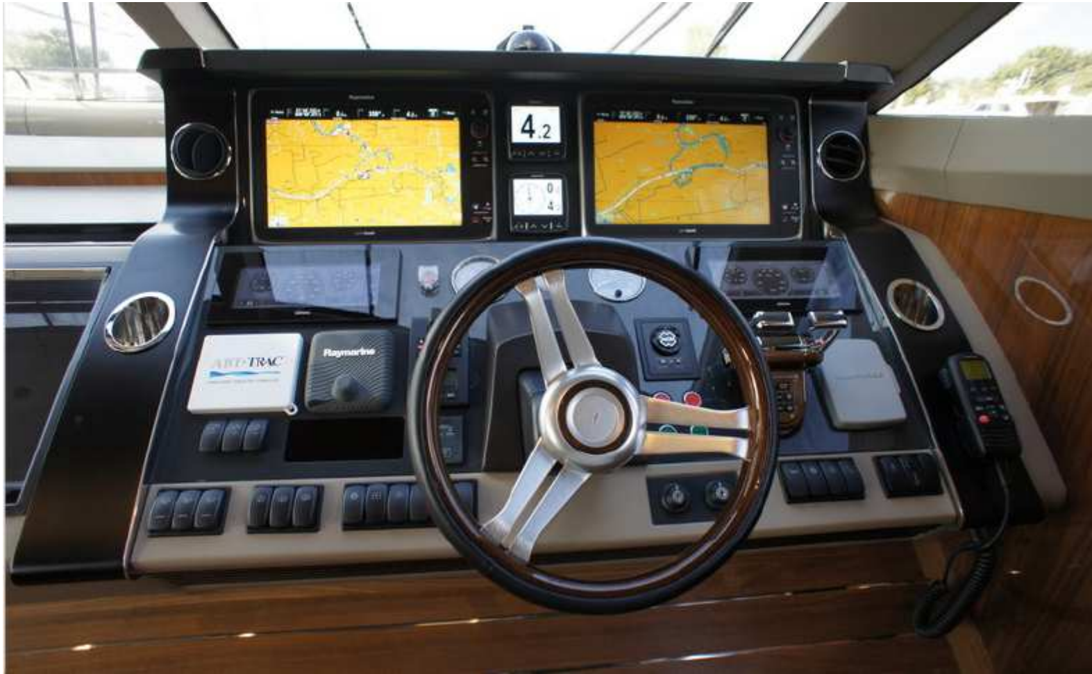
Princess 82' – Wheelhouse