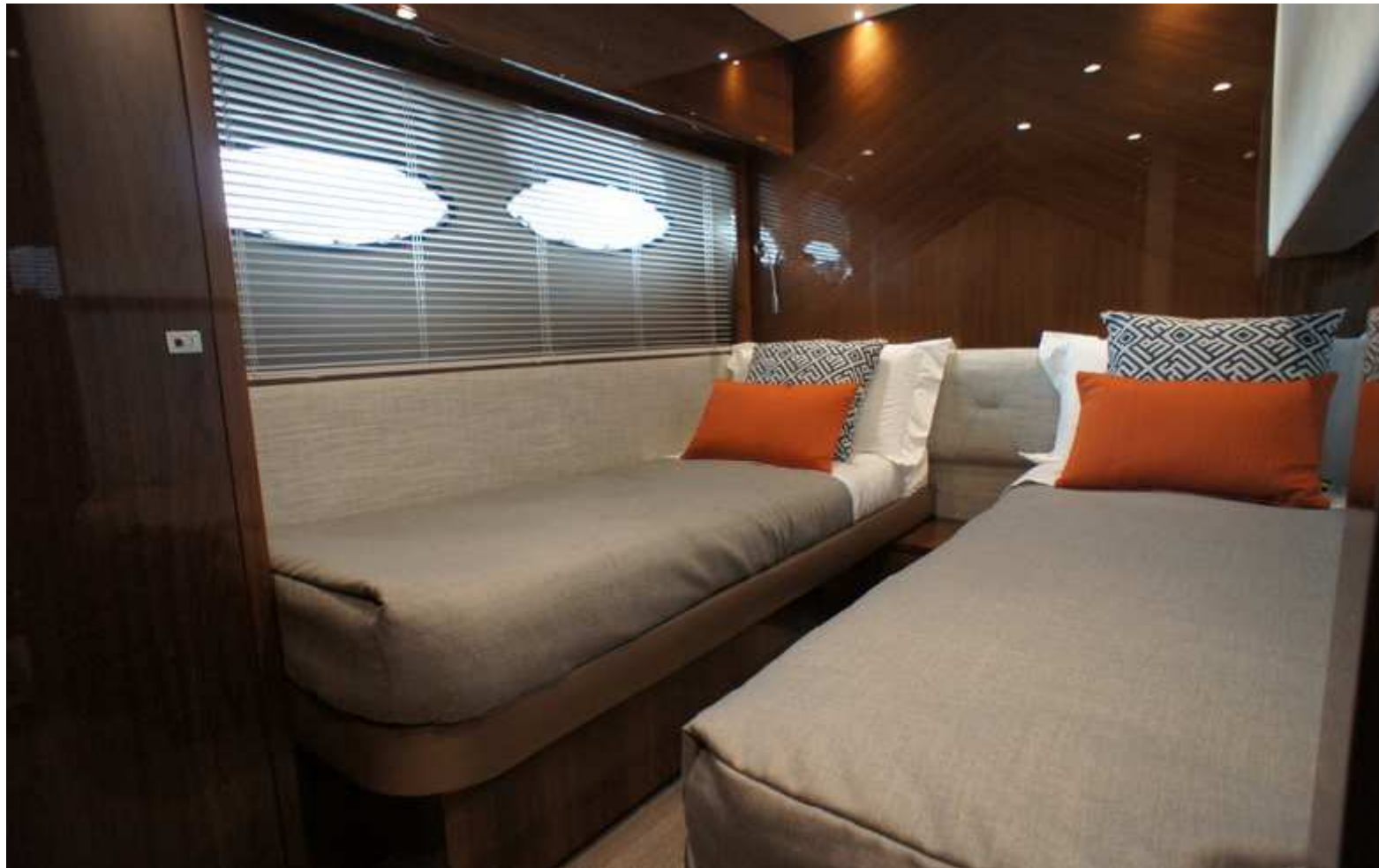
Princess 82' – Guests Cabin