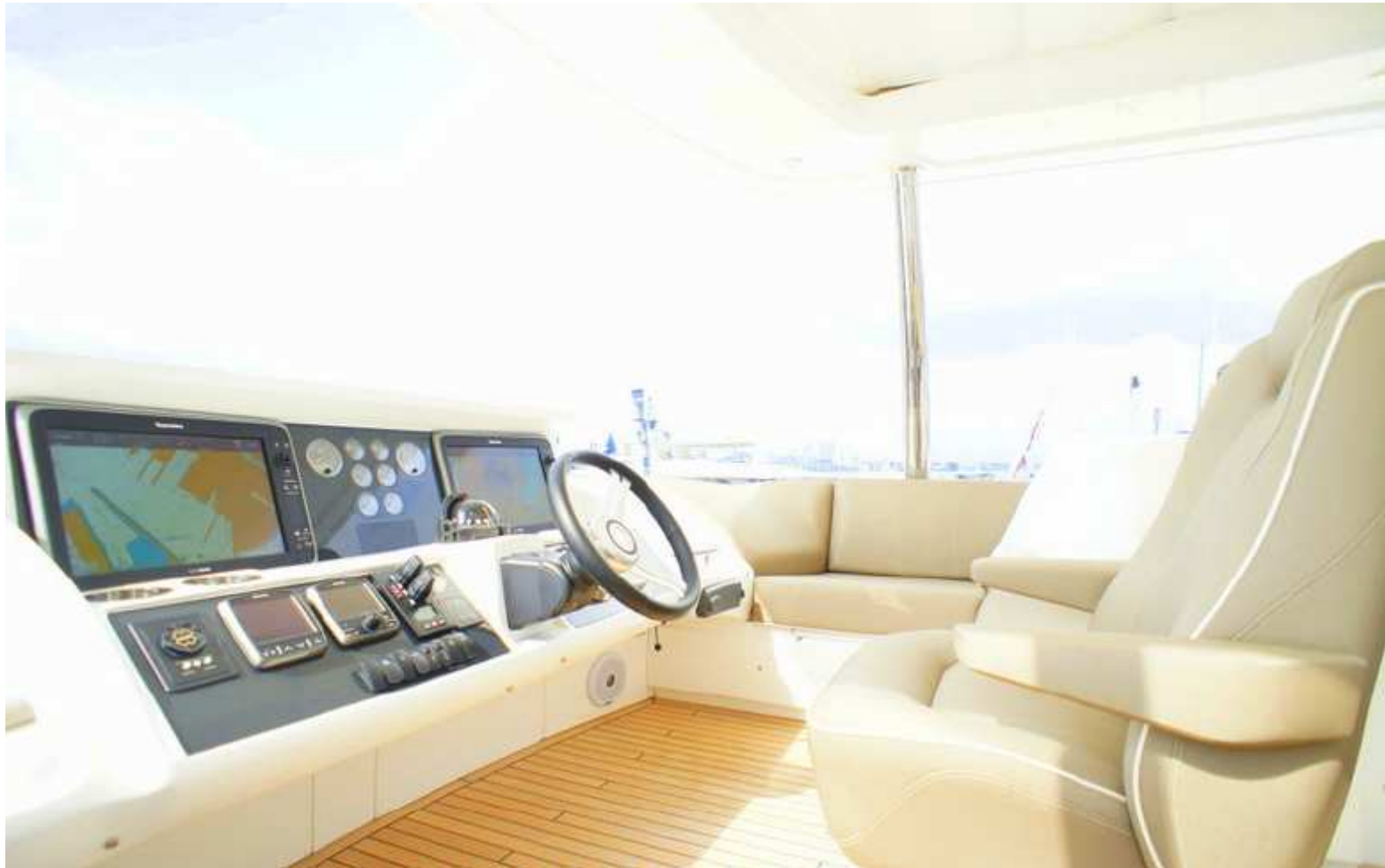
Princess 82' – Wheel House Sun Deck