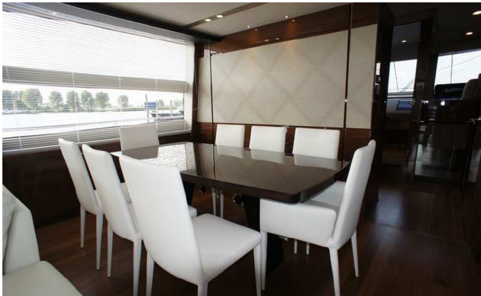
Princess 82' – Main Saloon Dining area