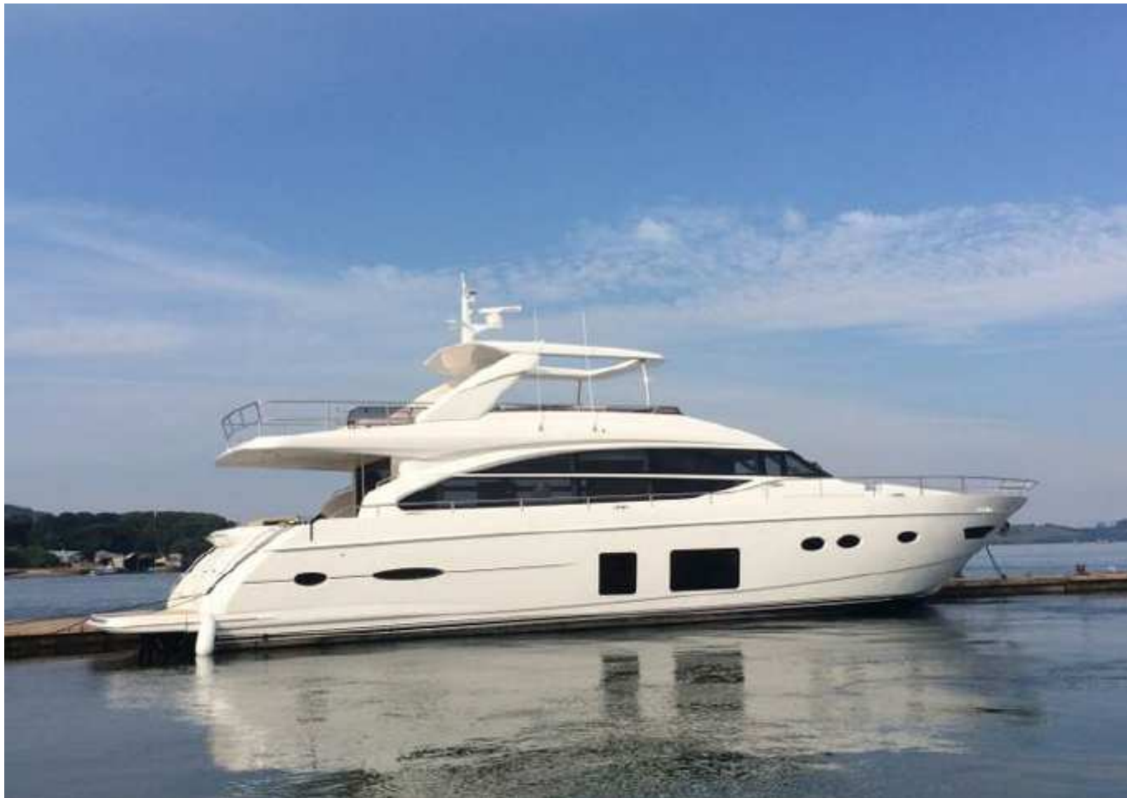
Princess 82' – External