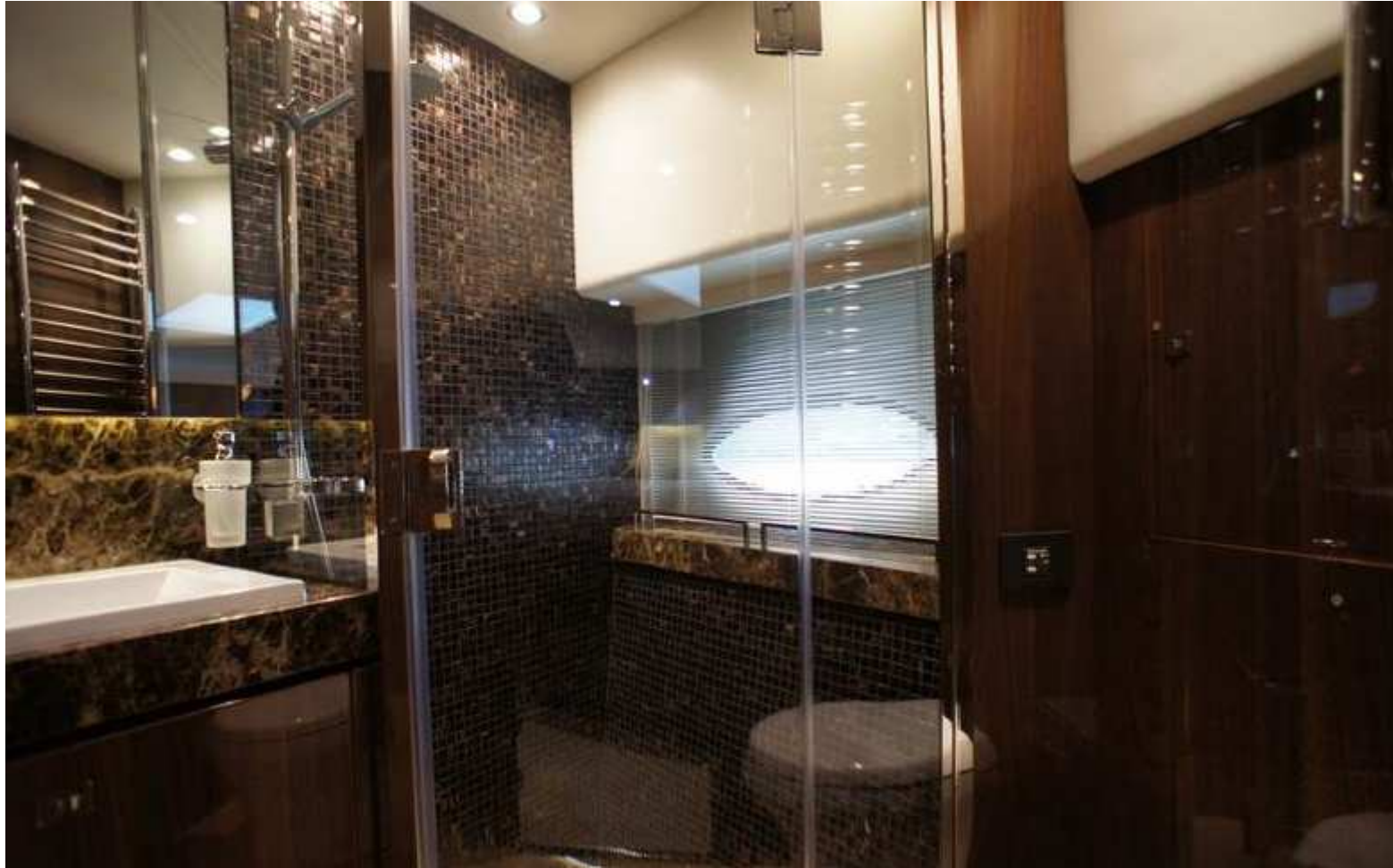
Princess 82' N- Vip Bath