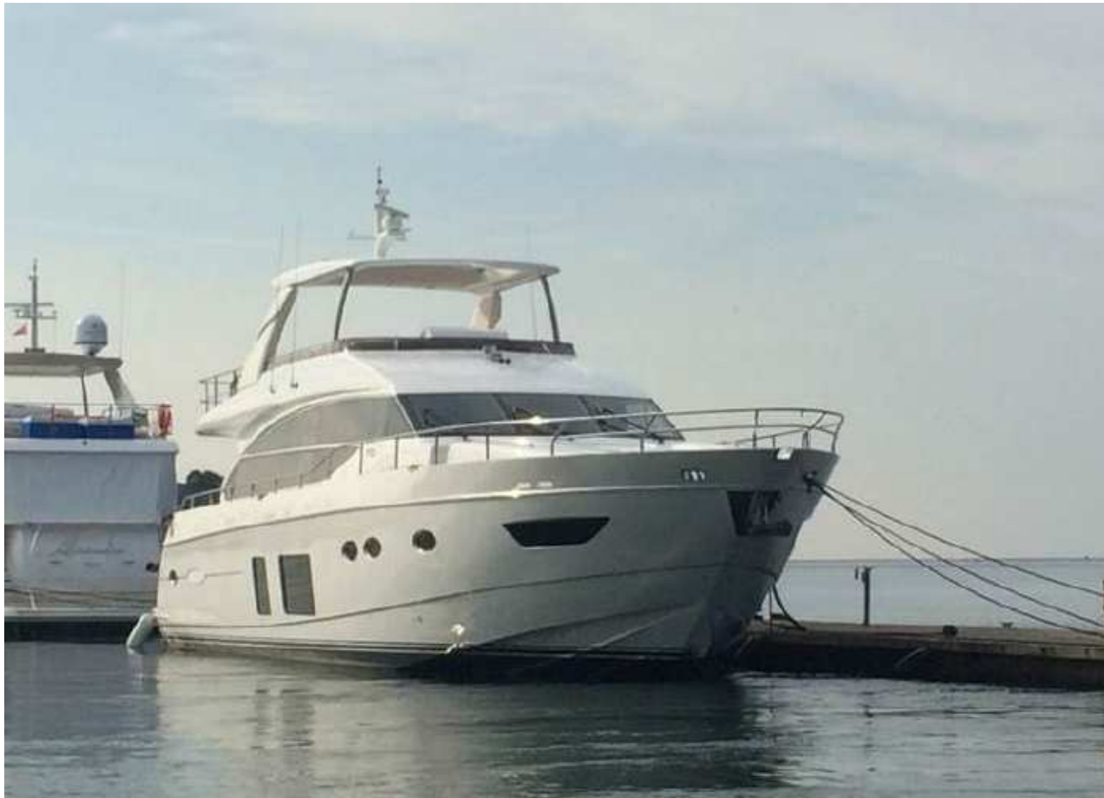
Princess 82' – External