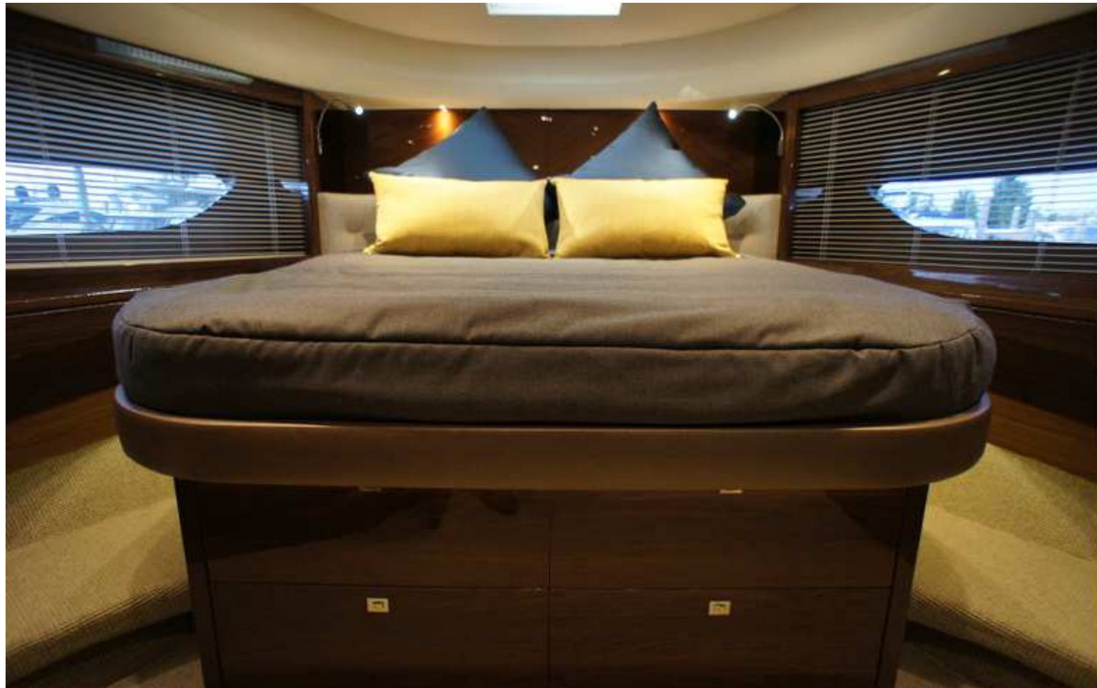
Princess 82'– Vip Cabin