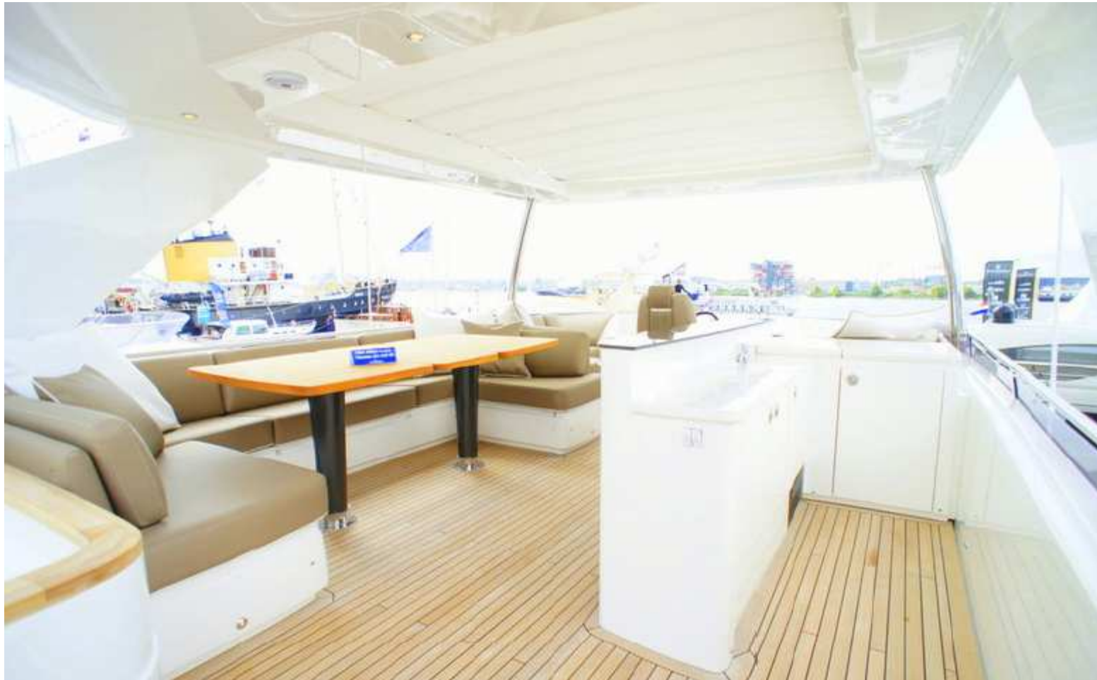
Princess 82' – Sun Deck