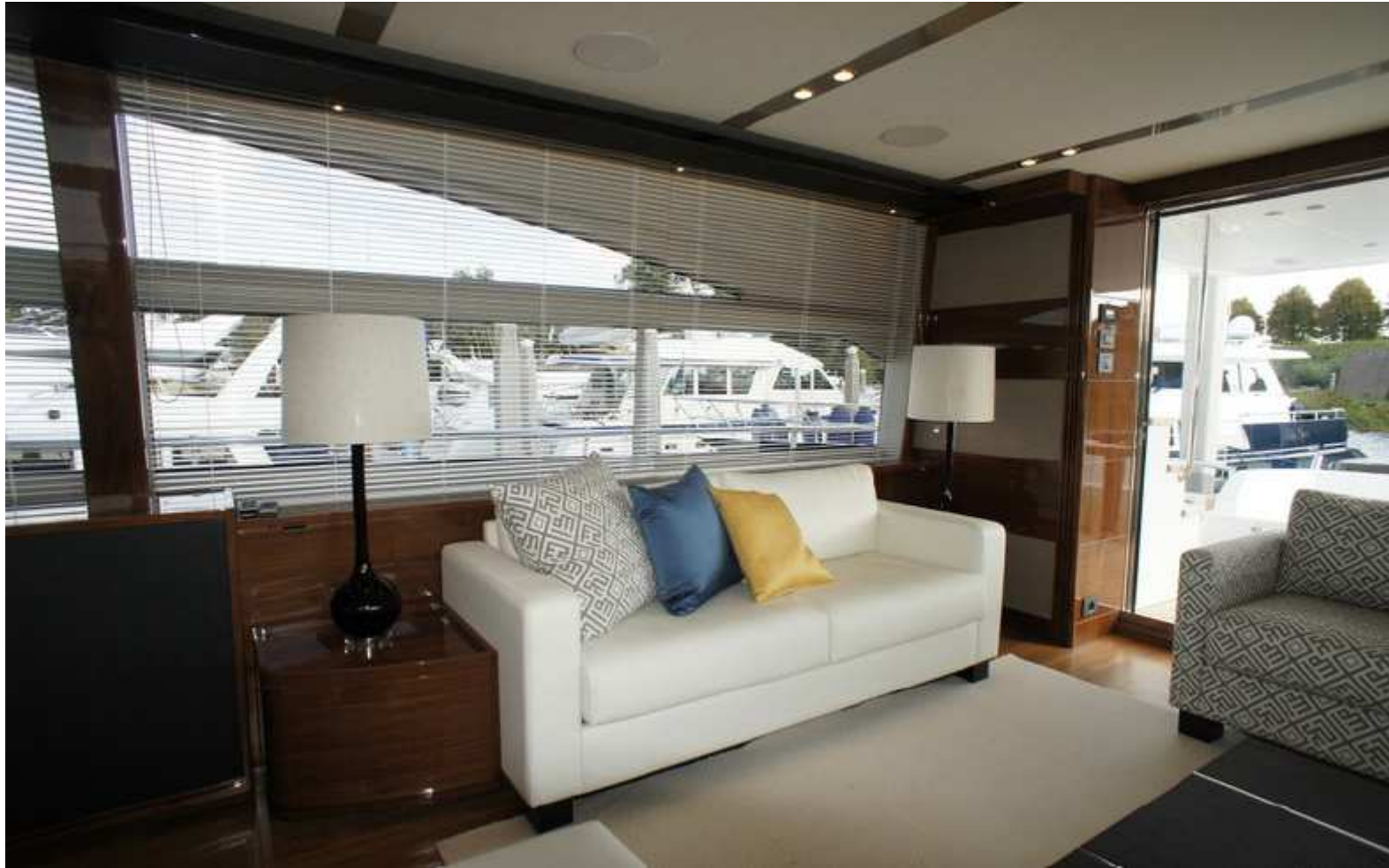
Princess 82' – Main Saloon