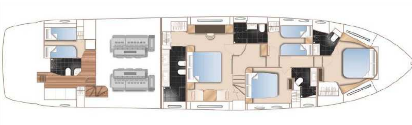
Princess 82' – Lower Deck