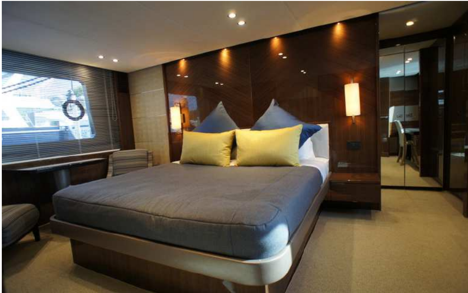
Princess 82' – Owner's Cabin